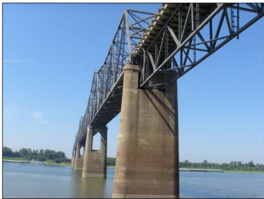
Existing US 51 Bridge

If the US 51 Bridge were not available for local traffic, the detour trip between Wickliffe, KY and Cairo, IL increases from 7 miles to 80+ miles per direction. Adding approximately 70 miles per direction to trips between Illinois and Kentucky would be a hardship to area residents. This is especially true for the population of Cairo, IL which exhibits elevated concentrations of minority and low income populations, which rely on the US 51 Bridge to access jobs in Wickliffe, KY. On the Kentucky side of the river, the US 51 Bridge is essential to farmers. Agriculture is a major component of Ballard County's economy and the bridge facilitates transport of crops and livestock from the county's farms to the interstates and ports in Illinois.