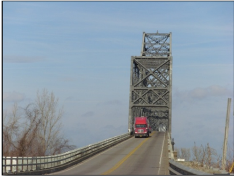
Narrow lanes and shoulders

Currently the bridge is allowed to carry legal loads, but permit loads (i.e. oversize or overweight vehicles) are not allowed. Under the no-build scenario it is anticipated the bridge would be closed to truck traffic around 2025 and closed to all traffic around 2030.